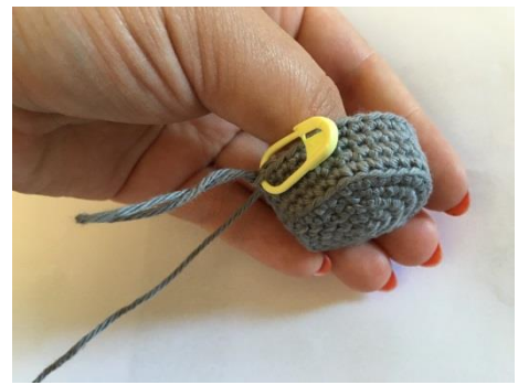
Picture of round 10